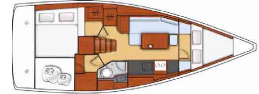
Cruiser - 3 cabins