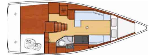
Week End - 2 convertible cabins