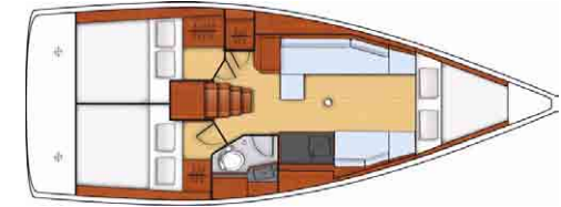
Cruiser - 2 cabins